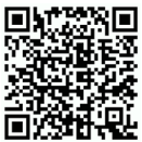
K120 3D demo